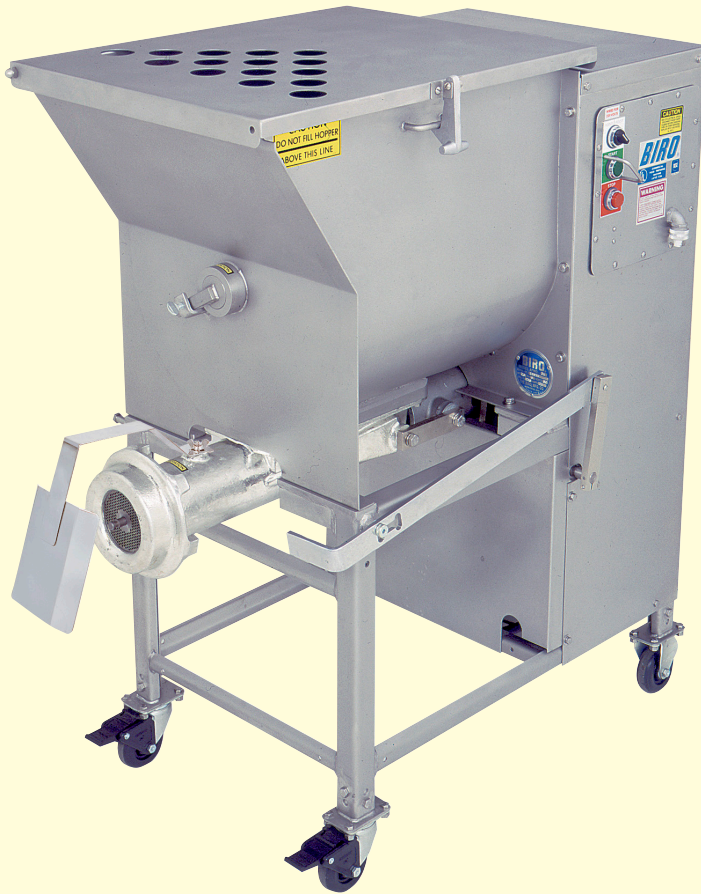
Shown with optional casters

The BIRO AFMG-24 Mixer Grinder is an ideal mixer grinder for today's compact supermarket meatroom. It's 5 hp/3.7 kW (7.5 hp/5.6 kW optional) auger motor, 140 lbs. (63.5 kg) hopper, and size 32 head can give you an output of up to 68 lbs. (31 kg) per minute for the productivity you need. For even more productivity, your AFMG-24 can come with an optional meat lug holder (see reverse) and an optional electric or pneumatic footswitch. The heavy duty stainless steel hopper, frame, and legs will stand up to years of daily washdown and still resist corrosion, so your mixer grinder lasts longer, and you get a better return on your investment. Of course, it's built with the superior engineering you expect from BIRO.