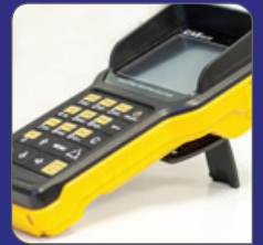
TWN Handheld Indicator with on-board data management features