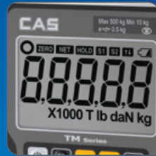
High-visibility 1.2" (30mm) LCD Display