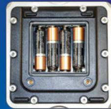
Battery Operated 4 AA batteries provide up to 500 hrs of use