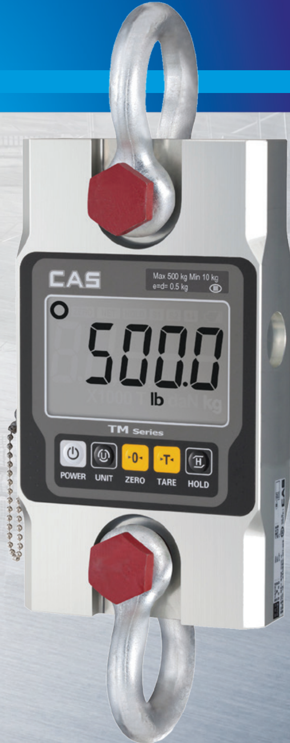
TM Series ▶